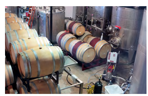
Wine in barrels being aged on the North Fork.

For docking, consider Strong's Water Club and Marina (www.strongsmarine.com/location/water-club) which offers protected tran-