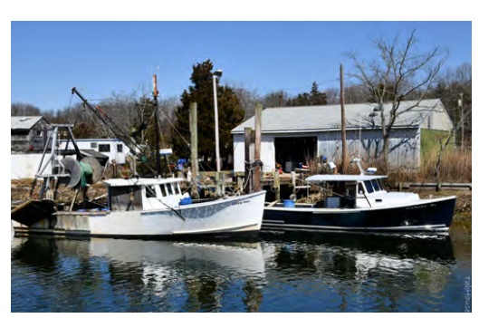
Fishing boats inside the Mattituck Inlet.

For the last six years, I have featured a series of stories called "Exit ... Off the Long Island Sound". The exits off the Long Island Sound coordinated with different bays one can visit. I started with exit one being Manhasset Bay and then covered the most practical north shore places to dock or throw the anchor out for a night or two. Last season's story was about exit six featuring Port Jefferson. (These back issue stories are available by emailing me at tab@tabhauser.com.) The seventh and final exit off the Long Island Sound is the Mattituck Inlet. This is because it is the last place you can cruise to on the Sound before the end of the north shore.