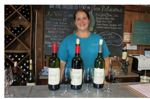
A friendly welcome at Lenz Wines.

you can also ask the marina concierge about a free shuttle service there. Walking east 2.5 miles you can visit Castello di Borghese, which was originally the Hargrave Vineyard where Long Island wine started. In total there are four vineyards to see an easy bike ride or an hour or less walk from the marina. Each vineyard has a different tasting policy in regards to cost and tiered levels. Some will credit the tasting cost towards a purchase. If you are unsure where to go, just follow the wine trail signs or plan in advance at www.liwines.com. For those that enjoy something stronger than wine, you should visit Long Island Spirits (www.lispirits.com) or the much smaller Twin Still Moonshine (www.liooldtymer.com). Long Island Spirits offer small-batch vodka, bourbon, whiskey, gin and infused spirits. Twin Still Moonshine is moonshine in assorted flavors. Each place has a tasting menu as well as cocktails. While visiting Long Island Spirits, do not miss one of Long Island's best pie bakeries called Briermere Farms down the road.